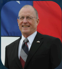
SENATOR BOB HALL