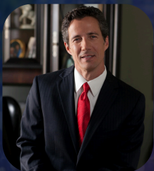
THE HONORABLE KELLY HANCOCK